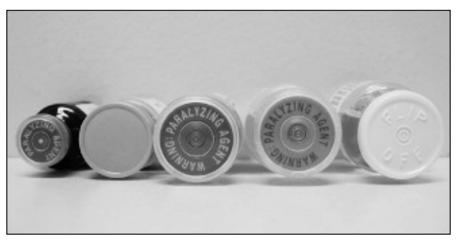
Figure 5: Examples of the variety of labelling/packaging of neuromuscular blocking agents in Canada.

To report a medication error to ISMP Canada: (i) visit the website, www.ismp-canada.org, or (ii) e-mail info@ismp-canada.org, or (iii) phone 1-866-544-7672 (1-866-54-ISMPC).