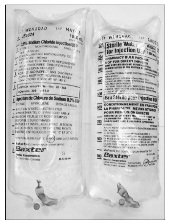
Figure 2: Before – 0.9% sodium chloride injection, left, and sterile water for injection, right, in Viaflex<sup>®</sup> bags. (Used with permission from ISMP Canada.) After – Colour photo of sterile water for injection available at: www.ismp-canada.org/download/ISMPCSB2003-06Sterile Water.pdf

Error reporting systems have been identified as an integral component in improving safety in many industries (Barach & Small, 2000). In particular, documentation of near misses, identified as occurring up to 300 times more frequently than adverse outcomes, can provide an effective and proactive source of information for reducing errors (Barach & Small, 2000). Furthermore, reporting of near misses (i.e., where harm was avoided) has fewer cultural and psychological barriers and can facilitate a blame-free approach to error reporting in general. Although hospitals have incident reporting mechanisms, near misses are much less commonly reported (Burdeau, Crawford, van de Vreede, & McCann, 2006). Studies on error reporting, including those focused on critical care environments, identify a variety of factors required to increase voluntary error reporting including increasing reporting of near misses, eliminating a punitive culture/moving towards a culture of safety, multidisciplinary reporting, timely feedback and follow-up that address improvements, and leadership commitment to patient safety (Bion & Heffner, 2004; Force et al., 2006; Ricci et al., 2004; Stump, 2000).