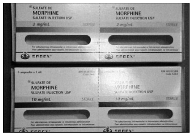
Figure 3: Before – Packaging for morphine 2 mg/mL and morphine 10 mg/mL ampoules. (Used with permission from ISMP Canada.)

Classifying the cause of an incident as "human error" will not lead to effective error-prevention strategies as humans can never achieve perfection, nor can they be expected to. Health care processes and systems should alleviate the pressures to perform perfectly and help lead us down the correct path of action. Vicente (2003) highlights the progress of other organizations in which errors can lead to catastrophic events. Vicente discusses how error analysis in the aviation industry evolved into the discipline of human factors engineering (HFE). He notes that in one particular kind of plane, controls for the landing gear and the flaps were identical in shape and placed side-by-side, which led to crashes and deaths due to pilots misidentifying the levers during take-off. Reports indicating "human error" did little or nothing to change recurrences until a more in-depth analysis was conducted with the few pilots who survived these crashes. Vicente notes that this led to a change in the shape of the controls (landing gear