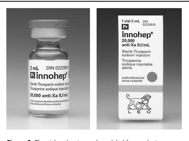
Figure 2. The vial and outer package label for product containing tinzaprin 20,000 units/mL do not indicate the total amount per total volume (i.e., 40,000 units/2 mL); the label information was misinterpreted as 20,000 units/2 mL.