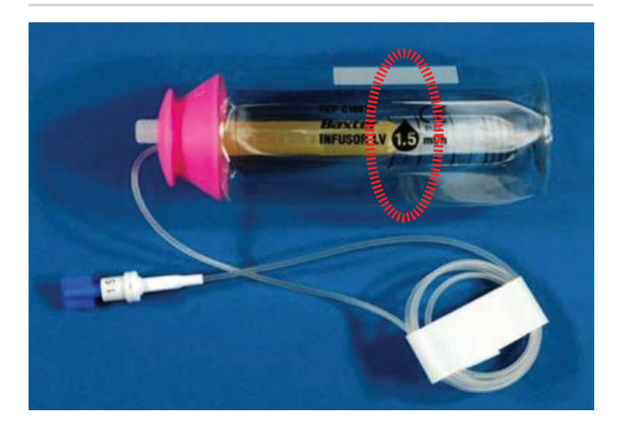
Figure 1. Example of an empty elastomeric infusion pump that delivers the medication at a rate of 1.5 mL/h. The rate of infusion is marked inside a black teardrop-shaped symbol (circled in red).

During the second day of treatment, the patient noticed that the pump was empty, and returned to the cancer centre for assessment. The clinical team determined that that the fluorouracil had been prepared in an elastomeric infusion pump that delivered the medication at a rate of 5 mL/h instead of 1.5mL/h (see Figure 2). Use of the incorrect pump had resulted in administration of the medication over 46 hours instead of the intended 7 days. Consequently, the patient was admitted to the hospital for observation for 2 days and was then discharged. Chemotherapy and radiation therapy were re-initiated the following week.