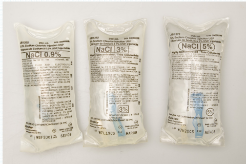
Figure 1. From left to right: 250 mL sodium chloride 0.9% (normal saline), sodium chloride 3%, and sodium chloride 5% solutions. All information on the labels is printed in black type.

The reporter also identified a need to better differentiate the sodium chloride 3% product from the sodium chloride 0.9% product (Figure 1).