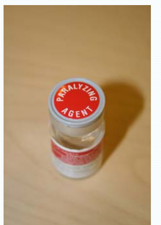
Figure 2: New vial cap for rocuronium (Zemuron) has red colour with "Paralyzing Agent" printed in

Figure 1: Revised labelling and packaging for rocuronium (Zemuron) includes a warning on the vial cap, and a bar code.