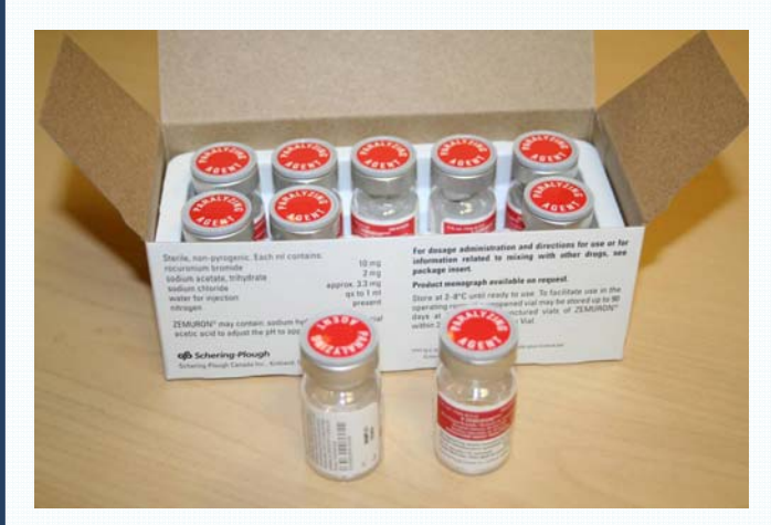
Figure 1: Revised labelling and packaging for rocuronium (Zemuron) includes a warning on the vial cap, and a bar code.

ISMP Canada is pleased to report that Merck recently changed the labelling and packaging of the neuromuscular blocking agent rocuronium (Zemuron). In addition to continuing to provide a peel-off label that can be added to a parenteral syringe, safety features now include a warning on the vial cap and a bar code, as illustrated in Figures 1 and 2.