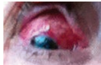
Figure 1. Photo of a consumer's eye after an injury with Clear Care

ISMP Canada has published three SafeMedicationUse.ca alerts warning consumers about this problem, and an alert for health professionals was published in a 2013 issue of the ISMP Canada Safety Bulletin. In April 2013, a Health Canada Advisory warned consumers and healthcare professionals about the issue, and Health Canada asked manufacturers to update the labels of Canadian products to highlight the risks of improper use. Since then, warnings have been added to the outer and inner labels of the Clear Care product. However, ISMP Canada has received a report of an incident that occurred despite the new labelling. The consumer used Clear Care solution directly from the bottle to rinse a contact lens and suffered severe pain caused by a corneal burn.