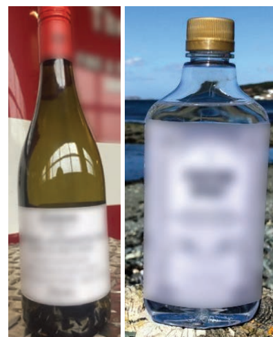
Figures 2 and 3:

Another potential concern is the reduced ability for consumers to recognize that the product is not intended for drinking because of its taste. Most hand sanitizers contain alcohol that has been deliberately